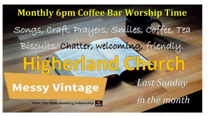
Come along @ 6pm Sunday 26<sup>th</sup> May